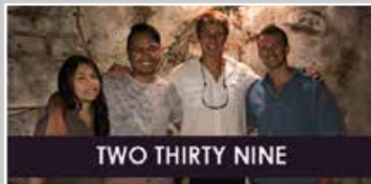
TWO THIRTY NINE