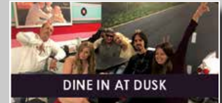
DINE IN AT DUSK

Escape Room Requirements: Geneva Trail & Dine In at Dusk Packages may only be purchased with a maximum of 10 guests. Two Thirty Nine may be purchased for a maximum 6 guests.